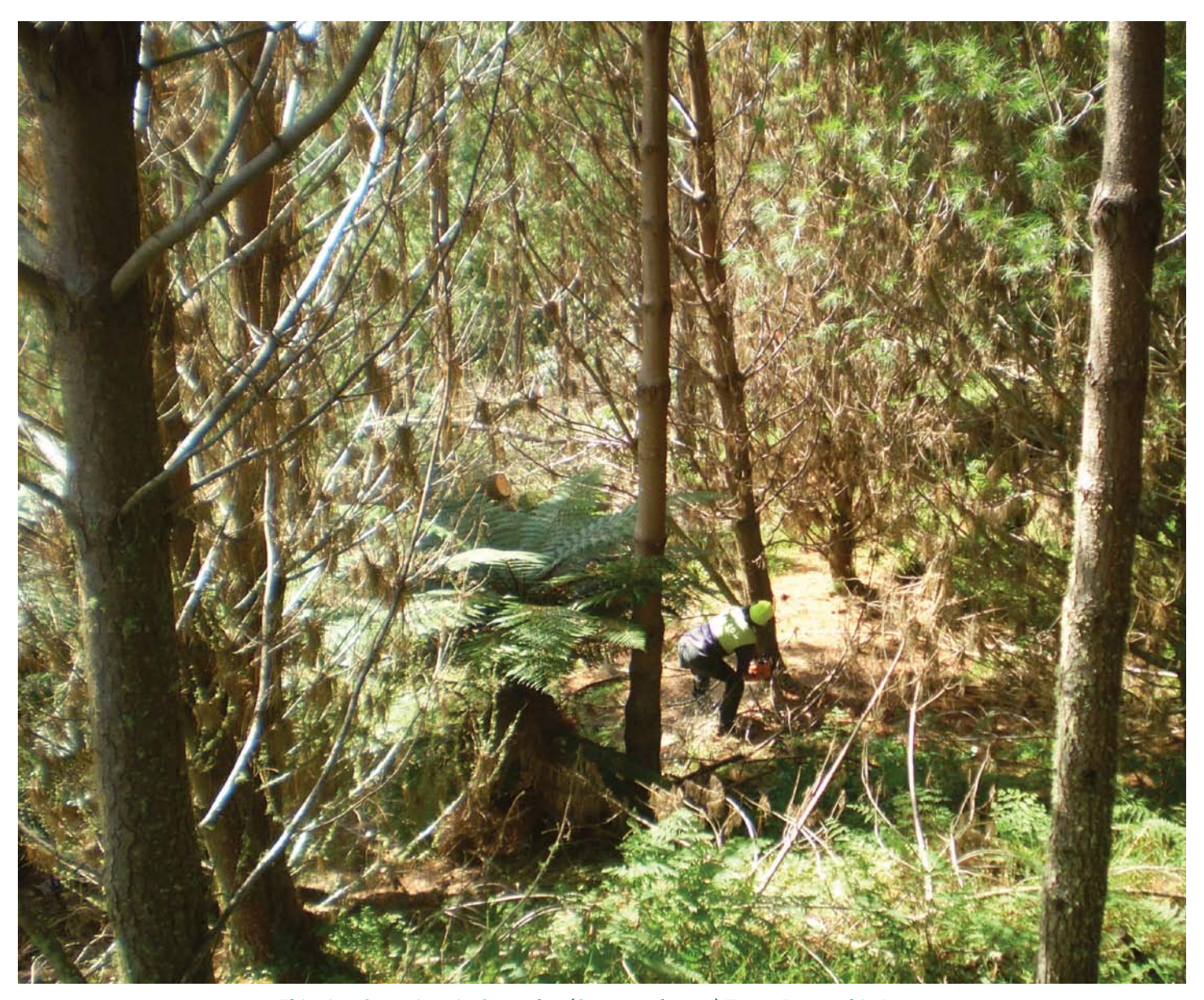
Thinning Operations in Greenplan (Greatwood 2003) Forest Partnership No.57

Operations at present include final pruning in Partnership 63 Scotts Bush and thin to waste in Greatwood Partnership 57. Progression is steady throughout both Partnerships with completion scheduled for later this year. Operational focus will then shift to third lift pruning and thin to waste in Woodview Partnership 58 and Wayleggo Partnership 62. Final audits will be completed in all Partnerships once operations have been completed. Independent forest consultants PF Olsen will carry out these audits.